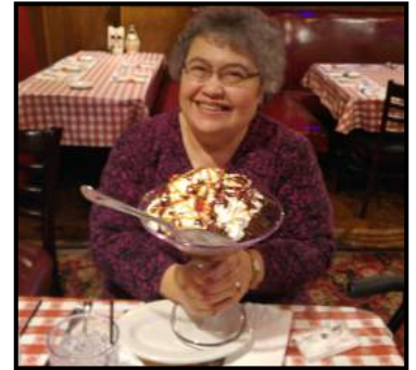
The cook shares her birthday dessert

In large bowl stir together until well blended the dry ingredients: flour, sugar, baking soda, baking powder, pumpkin pie spice and salt. Set aside. In another bowl mix together eggs, cranberry sauce, pumpkin, oil and pecans. Add pumpkin mixture to dry and mix by hand until well blended. Pour batter into two greased 9x5-inch loaf pans. Bake 55 to 65 minutes or until tests done when toothpick inserted in middle comes out clean. Cool in pan 10 minutes; remove from pan to rack.