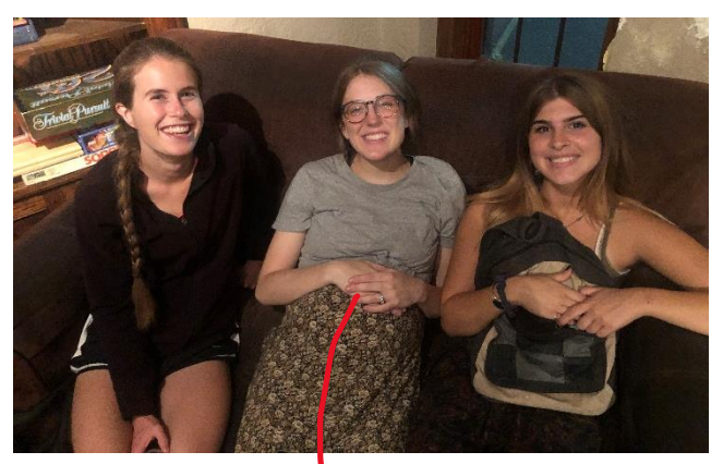
She was hiding!

Great new location on U of M campus fraternity row. Can you see four people in this picture?