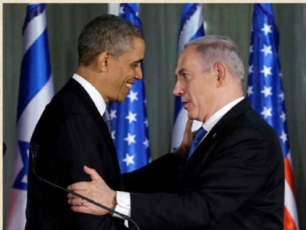
President Barack Obama with Israeli Prime Minister Benjamin Netanyahu Minneapolis Star Tribune, March 21, 2013