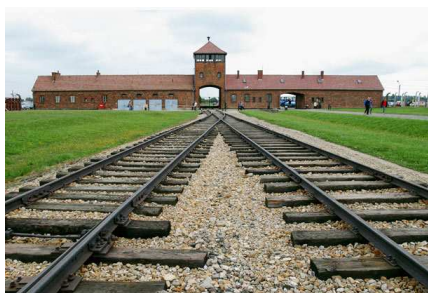
Auschwitz concentration and death camp. An estimated one million people were killed here of the 6 million during World War II.